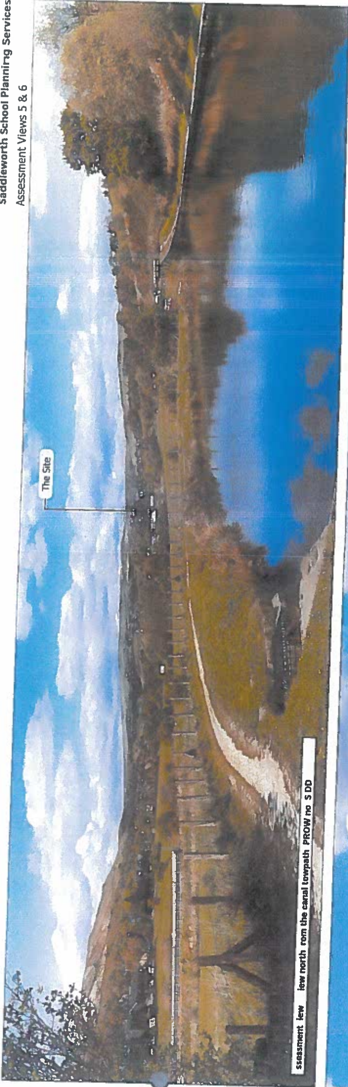
assessment low north from the canal towpath PROW no S DD