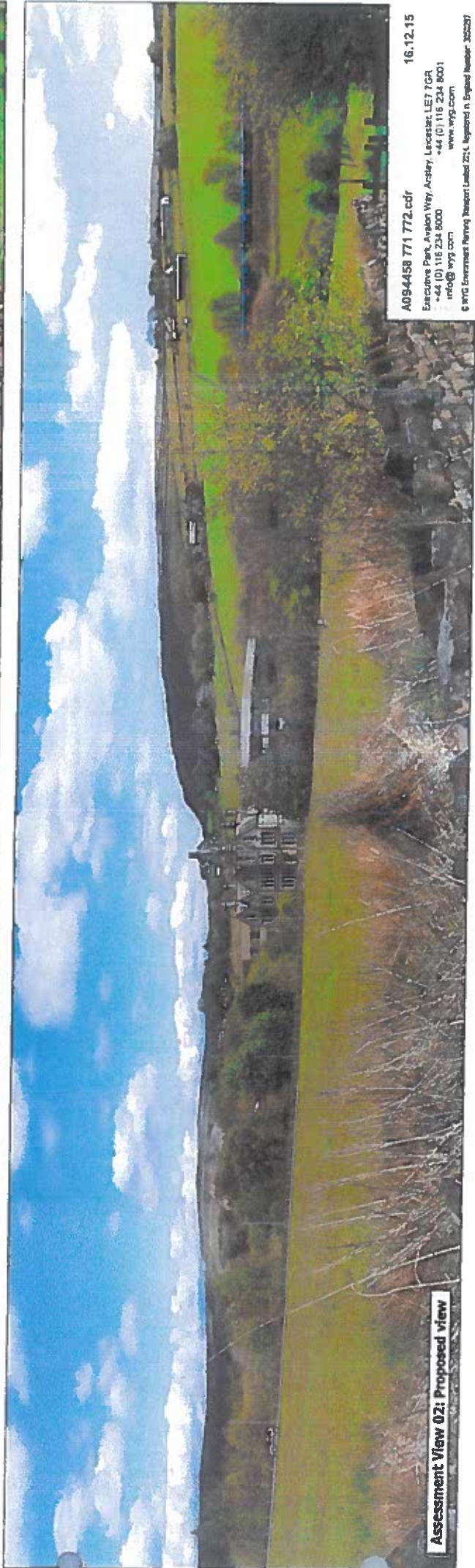
Assessment View 02: Proposed view

A094458 771 772.cdr 16.12.15 Executive Park, Avalon Way, Ardsley, Leicestershire, LE17 7GF +44 (0) 116 234 8000 info@wyg.com www.wyg.com © WYG Environment Planning Transport Limited 2014. Registered in England Number: 3055297