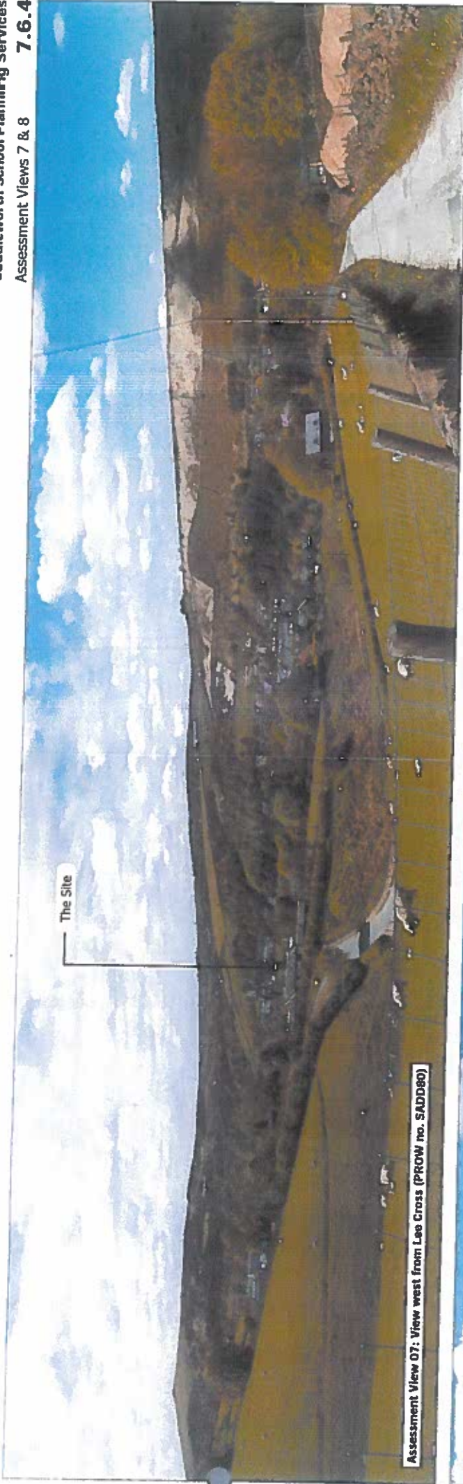
Assessment View 07: View west from Lee Cross (PROW no. SADD80)