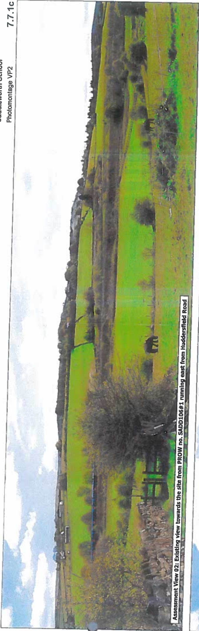
Assessment View 02: Existing view towards the site from PROW no. SADD106#1 running east from Huddersfield Road