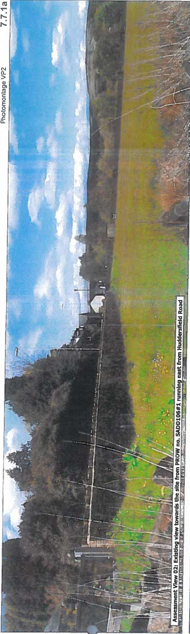
Assessment View 01: Existing view towards the site from PROW no. SADD106#1 running east from Huddersfield Road