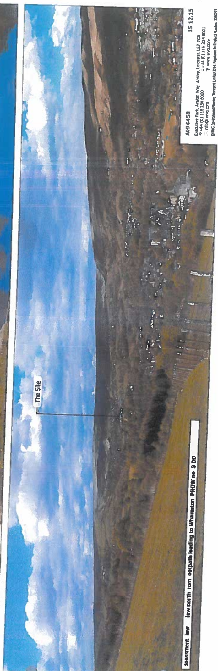
assessment low north from outpath leading to Wharmton PROW no S DD