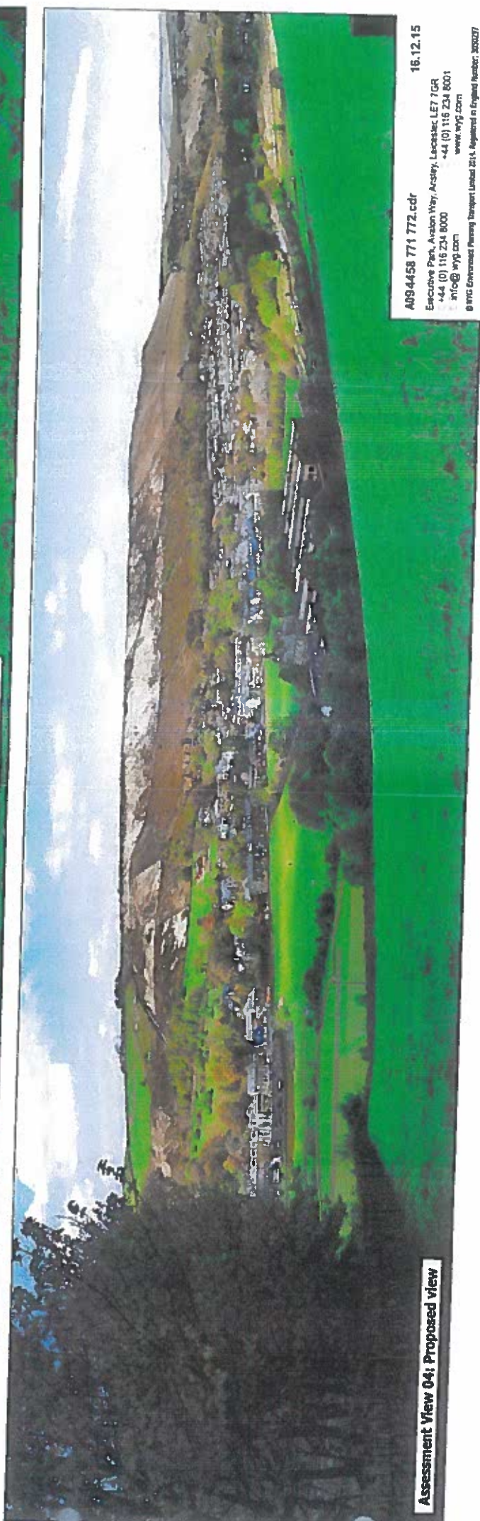
Assessment View 04: Proposed view