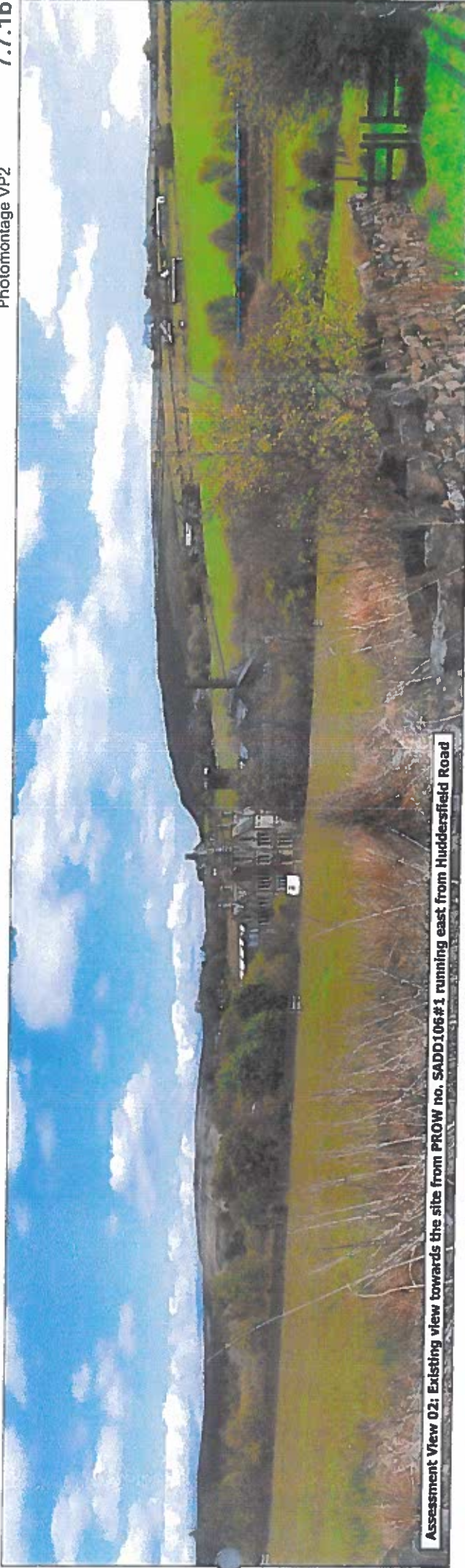
Assessment View 02: Existing view towards the site from PROW no. SADD106.#1 running east from Huddersfield Road