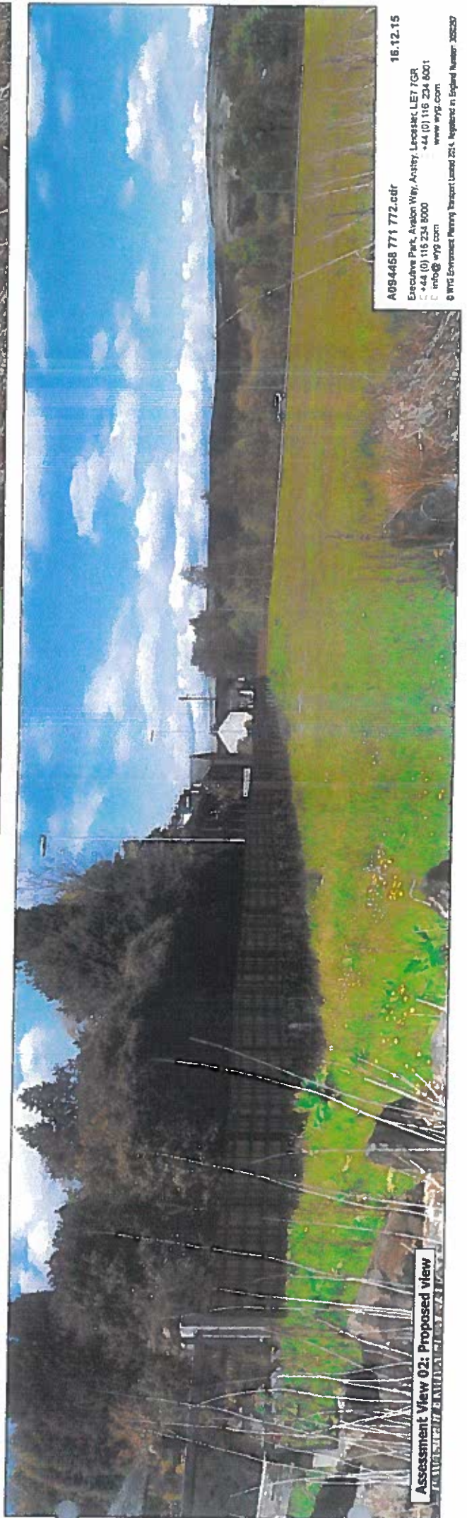
Assessment View 02: Proposed view