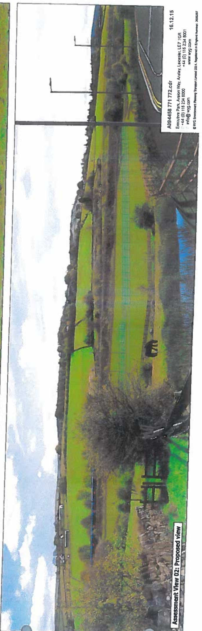
Assessment View 02: Proposed view

A084458 771 772.cdr 16.12.15 Executive Park, Avon Way, Anstey, Leicestershire, LE7 7GR +44 (0) 116 234 8000 +44 (0) 116 234 8001 info@wyg.com www.wyg.com © WYG Environment Planning Transport Leicestershire 2014. Registered in England Number: 202837