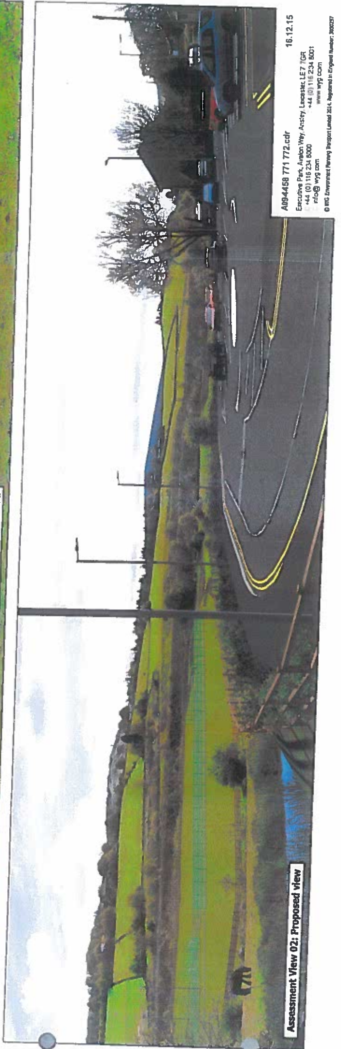
Assessment View 02: Proposed view