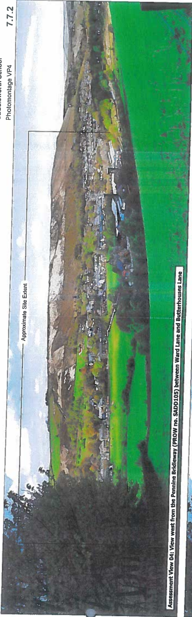
Assessment View 04: View west from the Pennine Bridleway (PROW no. SADD105) between Ward Lane and Butterhouses Lane