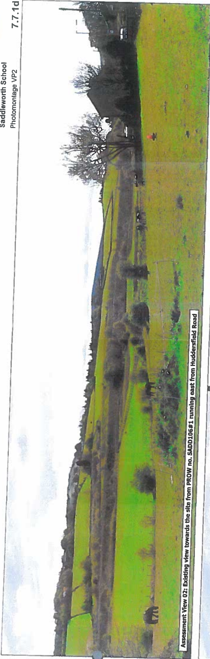
Assessment View 02: Existing view towards the site from PROW no. SADD106#1 running east from Huddersfield Road